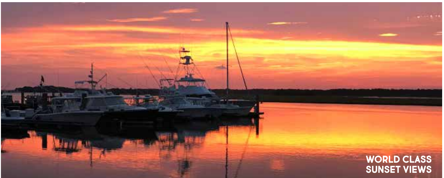
WORLD CLASS SUNSET VIEWS

add chicken // shrimp // fresh catch* grilled, blackened or fried market price // salmon grilled or blackened